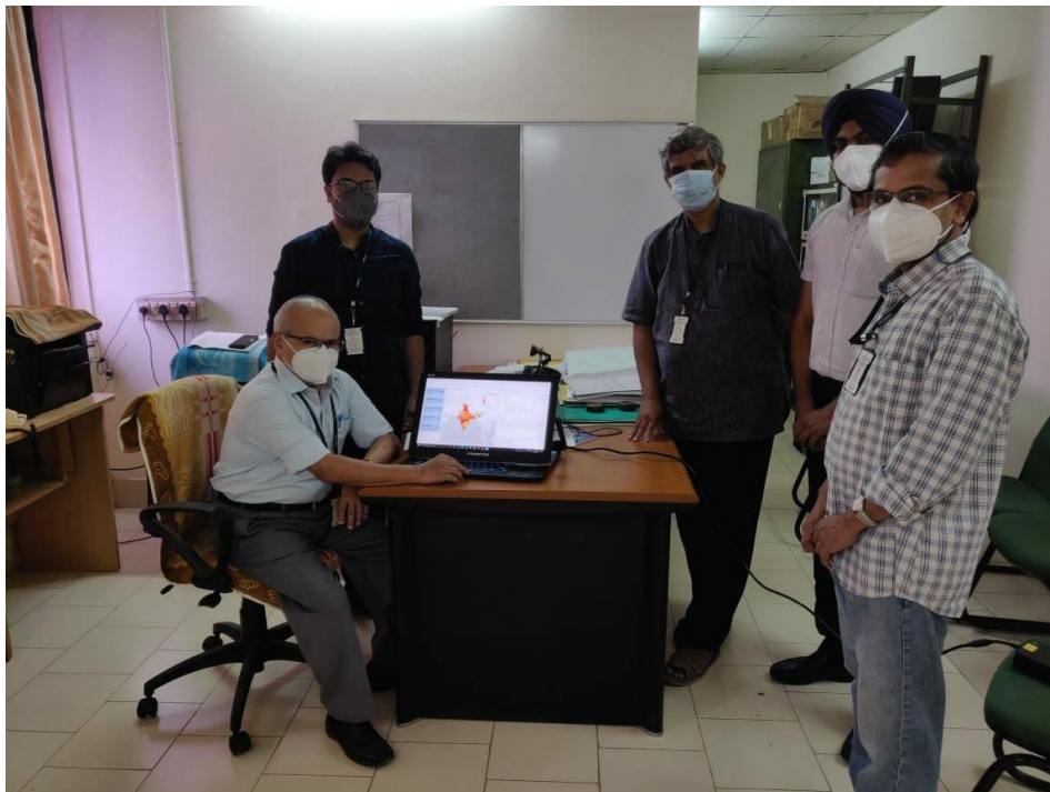
The Launch of AMCHSS COVID-19 Dashboard on 01/06/2021

The dashboard is available at: https://amchss-sctimst.shinyapps.io/covid_dashboard/ .